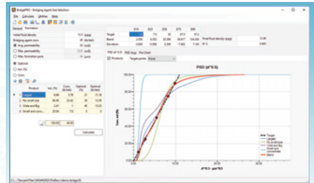
Particle Size Distribution (d 0.5 )